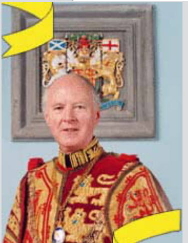
Robin O. Blair, LVO, WS, Lord Lyon, King of Arms

As people begin to explore their Scottish heritage, it's not long before they run into the terms clan, families, and septs. Questions usually arise as people try to find their clan affiliation based on their surname. The distinction between the three terms varies depending on the source. In general, the terms clan and family are interchangeable, with some sources identifying clans as being from the Highlands and families from the Lowlands, although the term clan seems to be commonly used for either origin. Septs are surnames that are considered to be associated with specific clans. For example, the surnames McDade, Davis, and Kay are all accepted septs of the clan Davidson.